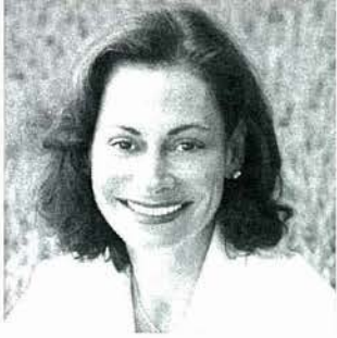
Headshot Photo